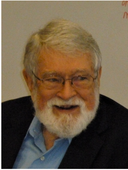
Dr. David Korten